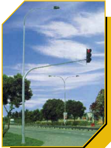
JUMA Standard 12°