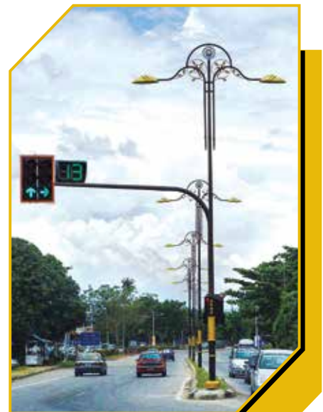
JUMA Decorative 0°