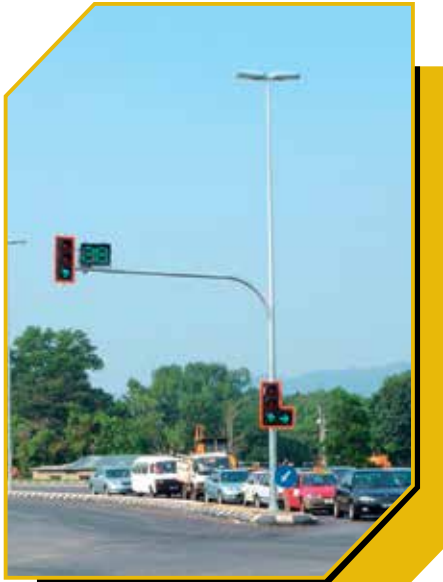
JUMA Standard 0°