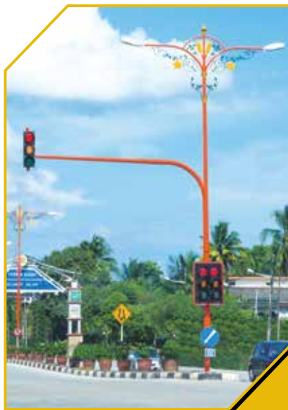
JUMA Decorative 0°

New approach to street furniture, stylish design and high quality hot dip galvanized finished. Also available with UV resistant powder coating in a range of colours and height to harmonize with the environment.